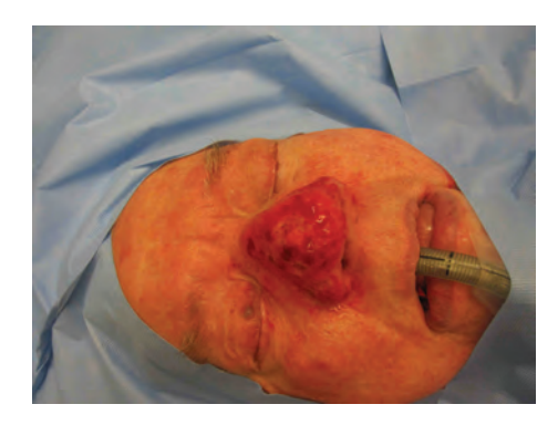
Figur e 8: Case 3, intraoperative frontal post reduction.