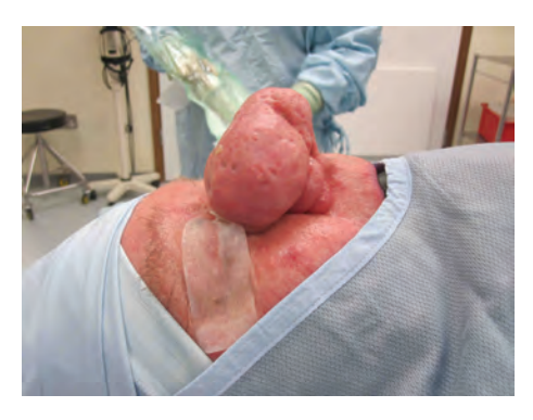
Figur e 5: Case 3, intraoperative lateral.

of connective tissue, dermal fibrosis, and sebaceous gland hyperplasia are observed. Four variants of rhinophyma can be recognized: glandular, fibrous, fibroangiomatous, and actinic. In glandular form, the nose is enlarged mainly because of sebaceous gland hyperplasia. In the fibrous form diffuse hyperplasia of the connective exists. In the fibroangiomatous form fibrosis, telangiectasias, and inflammatory lesions are present. In the actinic form, nodular masses of elastic tissue distort the nose [4]. Although different histological subtypes do seem to occur, the diagnosis of rhinophyma is clinical. A biopsy can be useful where there is concern to rule out possible differentials such as lupus pernio, basal cell, squamous cell, sebaceous carcinomas, or nasal lymphoma [5].