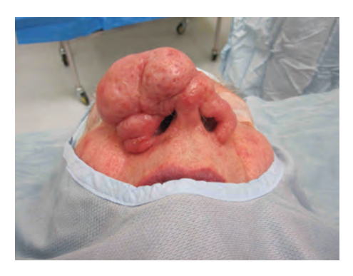
Figur e 7: Case 3, intraoperative basal.