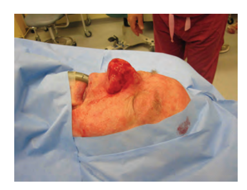
Figur e 9: Case 3, intraoperative oblique post reduction Photos.